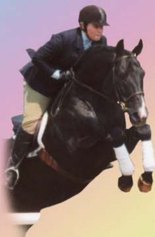
Grandom Grannus/Domspatz/ Senat/Agram